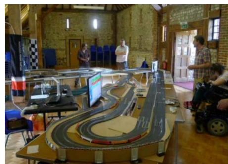
June 2017 WHO/digital Saturday